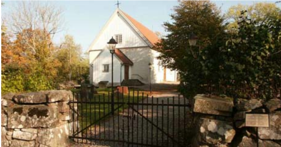
Torps Church built around 1750

Next step in their life is when they moved to work at the Torps vicarage in Elfsborgs län about 100 miles southwest of Mårbacka. (5/6 1867), west of the southern part of the large lake Vänern. At Torp there first child is born, Carl August 15/12 1867